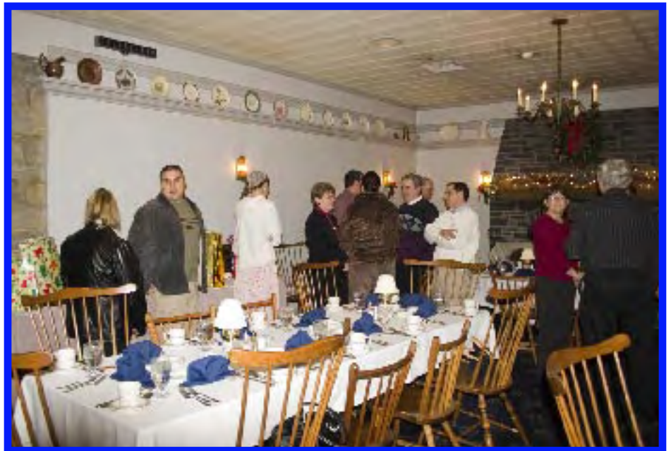
Guests chat before dinner