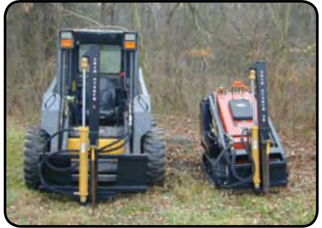
Stake puller attachments for skid/mini skid loaders