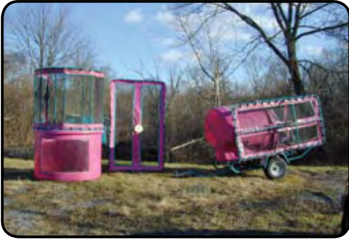
The Purple Dunk Tank is back! Formerly manufactured by FunTec, we have purchased the molds, jigs, and rights to produce this popular dunk tank again. We also have some demo units available at a great price.