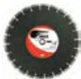
MK-762 DMX™ Dry General Purpose Diamond Blade